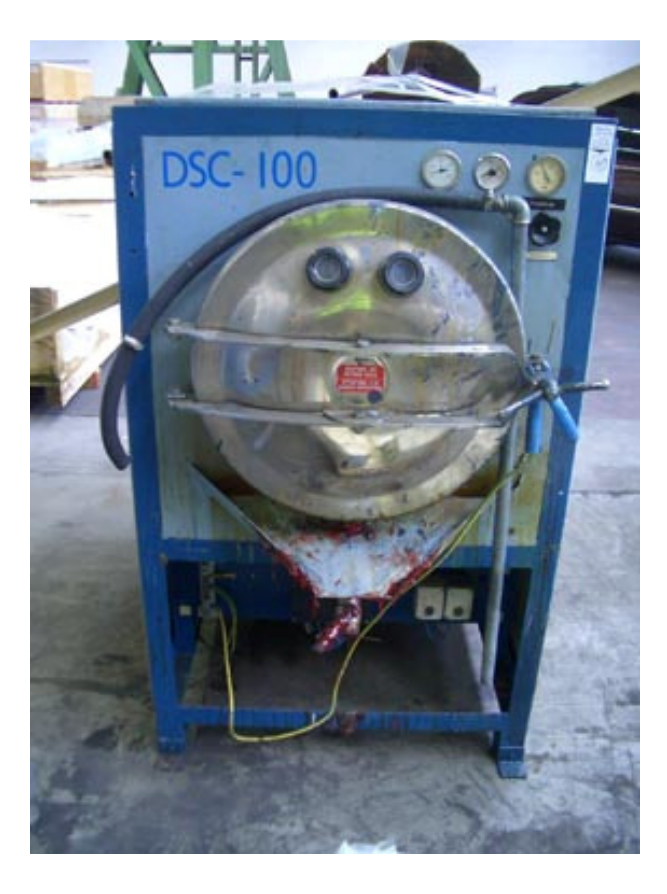
DSC 100 in our warehouse