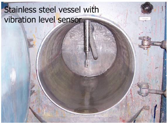
The condition of the vessel is excellent. The vibration level sensor is absolutely reliable.

OFRU DSC 200 stainless steel with vacuum Year of make 2000 – very good condition Very power-full with 24 KW