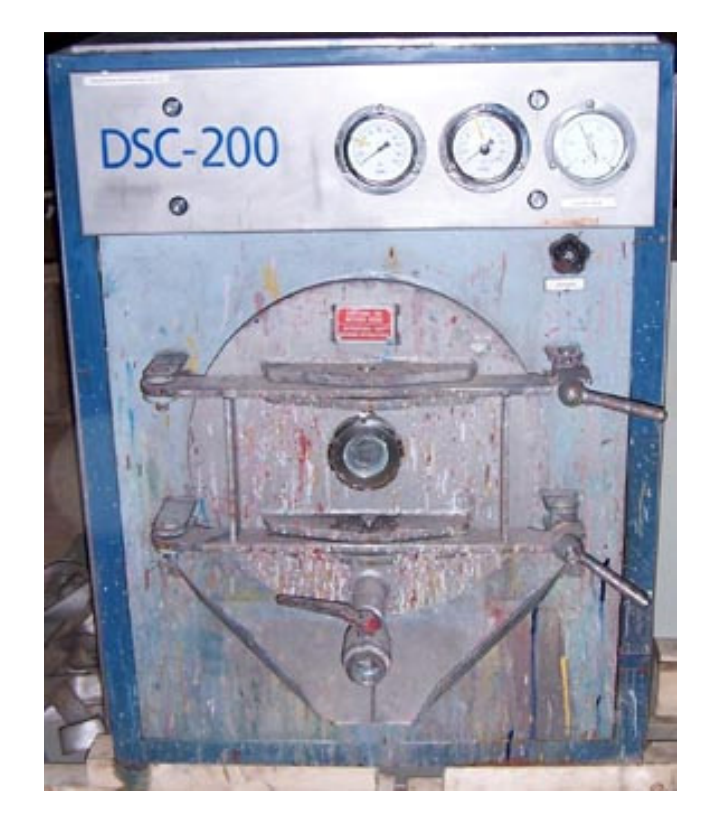
with working hour meter