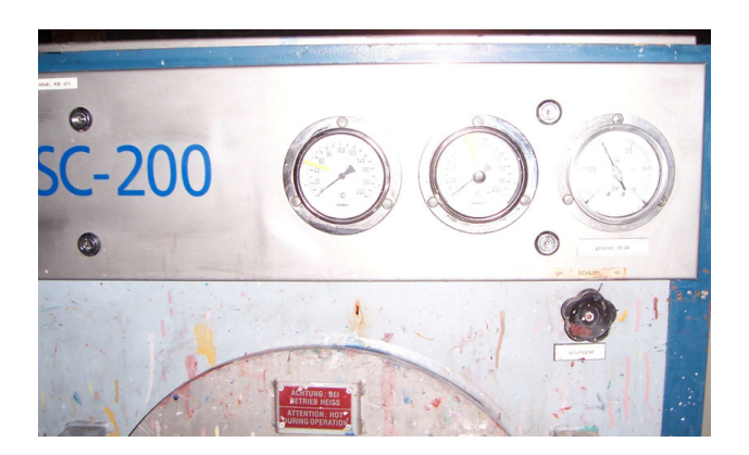
Was in operation only for 3 years.